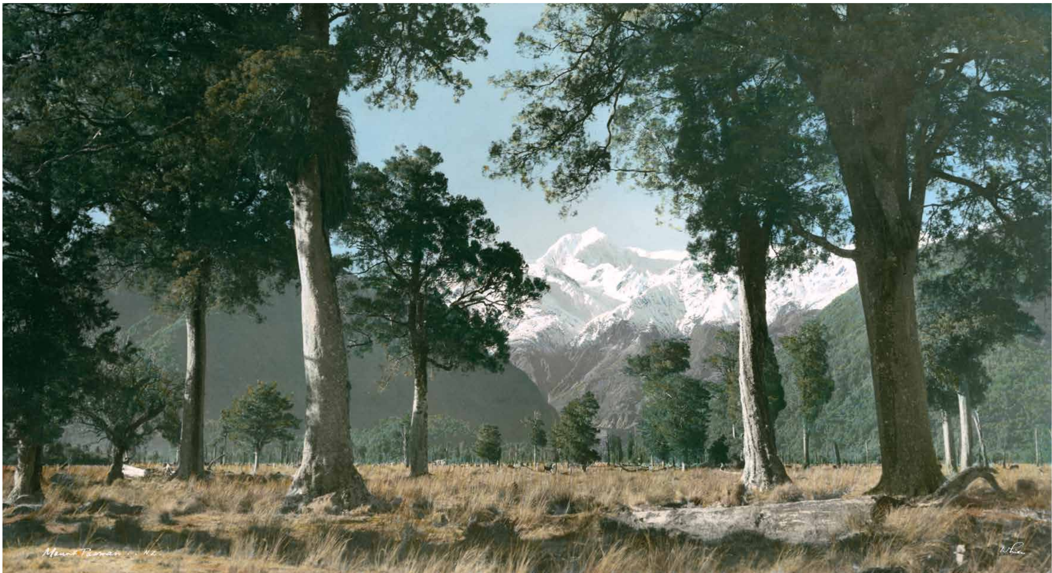
Mount Parnassus, N.Z.