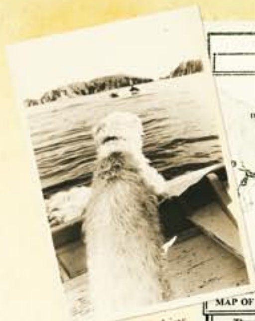
Herbert and dolphins near French Pass.