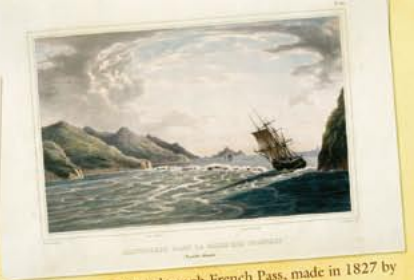
The dangerous passage through French Pass, made in 1827 by the explorer D'Urville in his ship the Astrolabe .